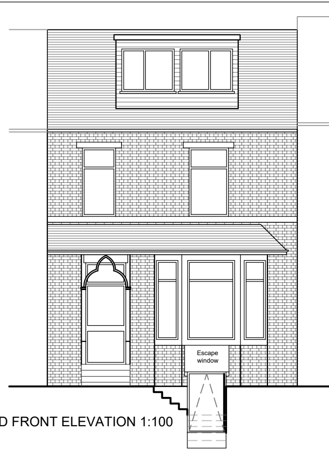
PROPOSED FRONT ELEVATION 1:100 @ A3