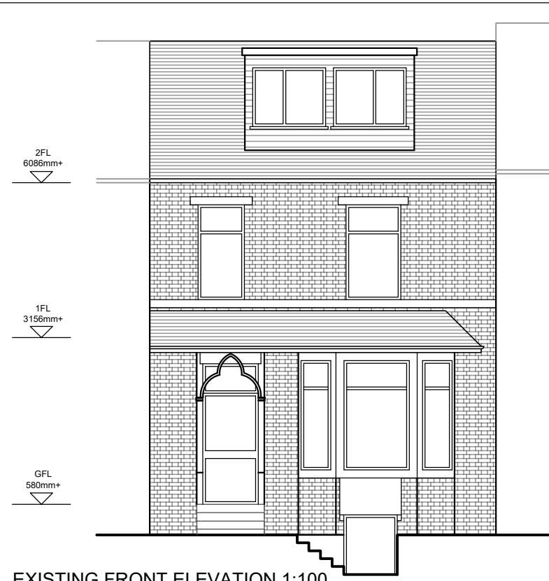
EXISTING FRONT ELEVATION 1:100 @ A3