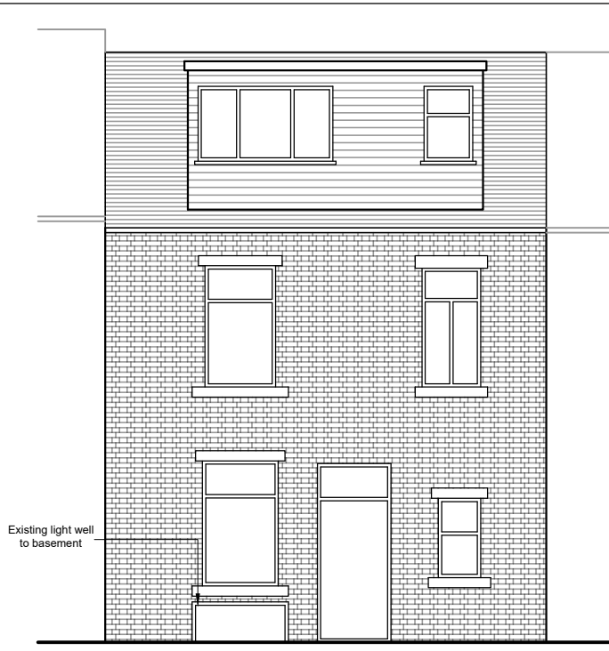
EXISTING REAR ELEVATION 1:100 @ A3 (no change)